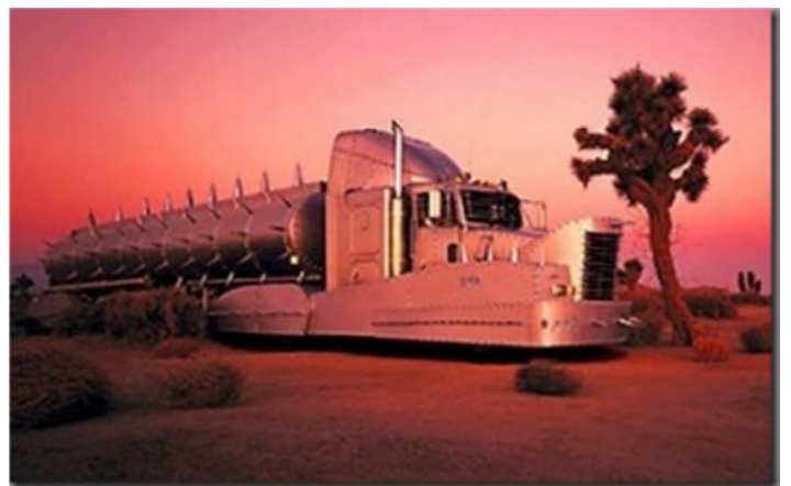
Imagine pulling into town in this rig!