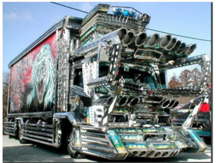
Tricked out for sure!