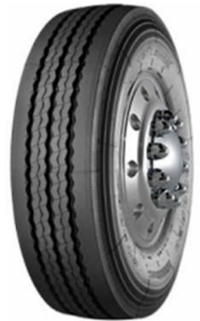
GT978+ Mixed Service Tire

The GT978+ is available in the popular 385/65R22.5 size.