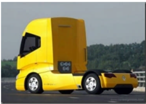
Renault's vision of the future