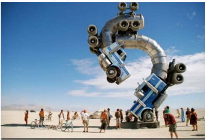
How in the world?

What did you want to be when you were growing up? A musician.